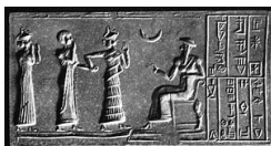
Code of Ur-Nammu, 2000 BC (4000 yrs ago)